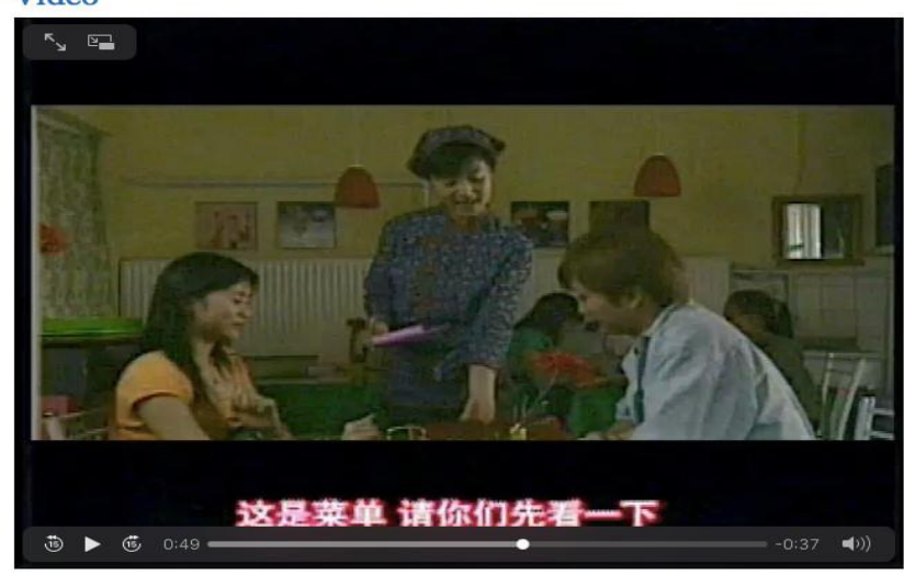
Figure 1 An example video from the Chinese online materials

The video presentation is followed by multiple-choice questions to test students' basic understanding of the video. Since the video contains new vocabulary and grammar structures, students need to make inferences from context and language elements they have previously studied in order to answer the questions. The questions are delivered in a tutor format to facilitate hints and logging of student responses in the centralized data repository. This design helps students learn how to pick things they can understand out of a dialogue that also contains elements that they may not understand. Practicing this helps them to feel comfortable engaging with language that contains some elements they have not studied yet.