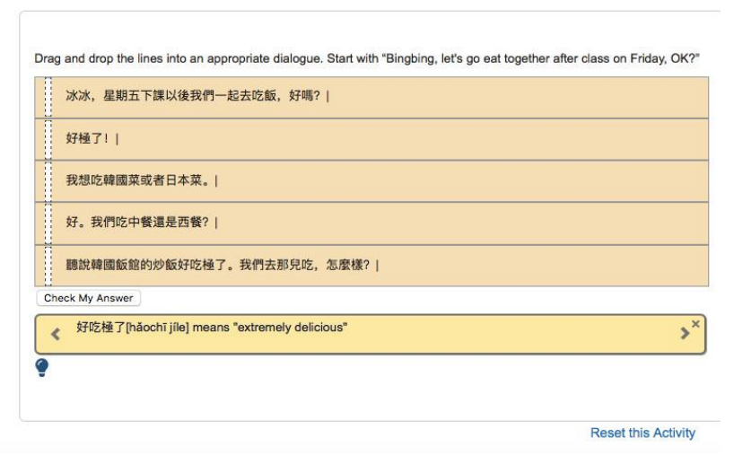
Figure 2 An example online drag-and-drop tutor