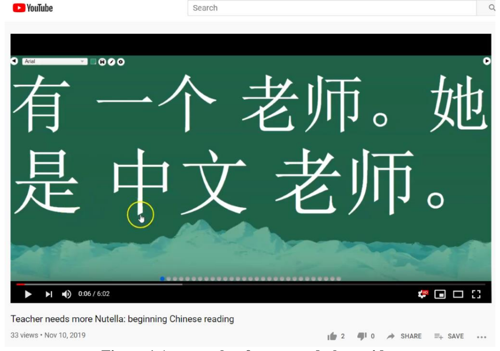
Figure 1 A screenshot from a read-along video

appear many times throughout the text: approximately ten to 20 times. The reading tends to be a story, description, or other type of multiple paragraph-long, coherent discourse based on language and topics that arose during the previous class session. Appendix A contains an example of the content of a read-along video designed for the first reading text for a beginning class. See Figure 1 (below) for a screenshot from a read-along video. The golden circle in the image is how the cursor appears in the program I use to record videos, Screencast-O-Matic. Note that the font size is very large, which is intentional so that characters can be seen clearly. Spaces between words have been deliberately added to aid in word segmentation and therefore ease of comprehension (Bai, et al, 2013). The video recording contains my carefully articulated, read aloud of the text, using the cursor to coordinate with my voice as I read. Appendix B includes links to two read-along videos.